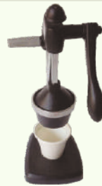
Hand Operated Juicer