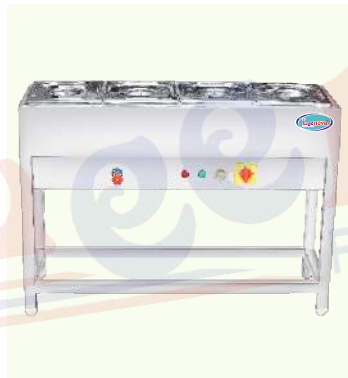
Bain Marie (GN PAN)