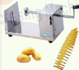
Potato Tornado Cutter