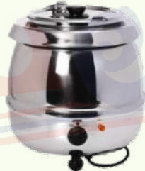
S.S. Soup Station