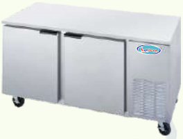
Under Counter Freeze