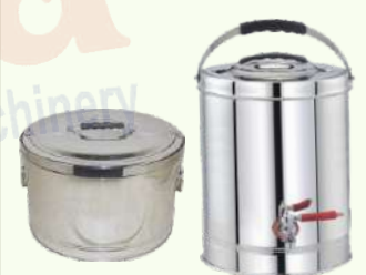
Hot-Pot & Tea Thermos