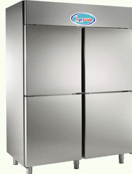
4 Door Vertical Freeze