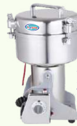
Instant Masala Grinder