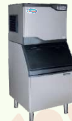
Ice Cube Machine