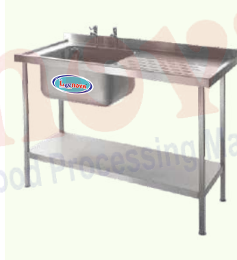
Single Sink with Table